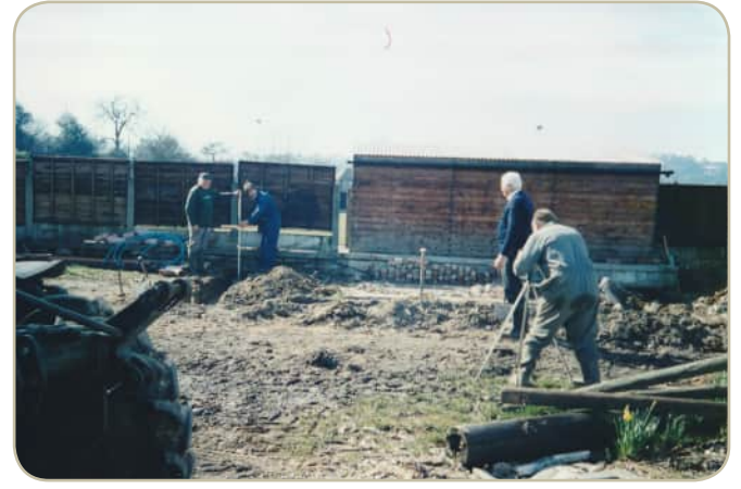
New pavilion build - 1995